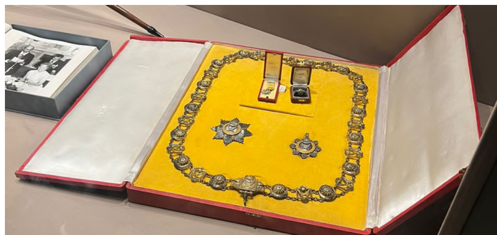
'Ojaswirajanya Manpadawi' conferred on President Anwar Sadat by King Birendra during the latter's visit to Egypt in February 1981 has been kept at Bibliotheca Alexandria, a major tourist attraction of the city.